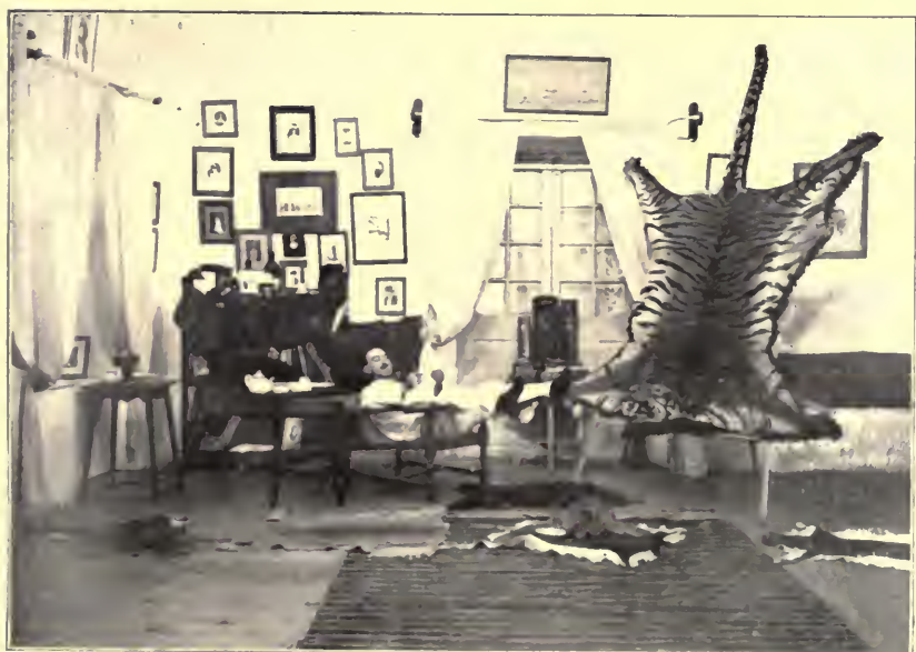
THE TIGER'S LAST HOME.